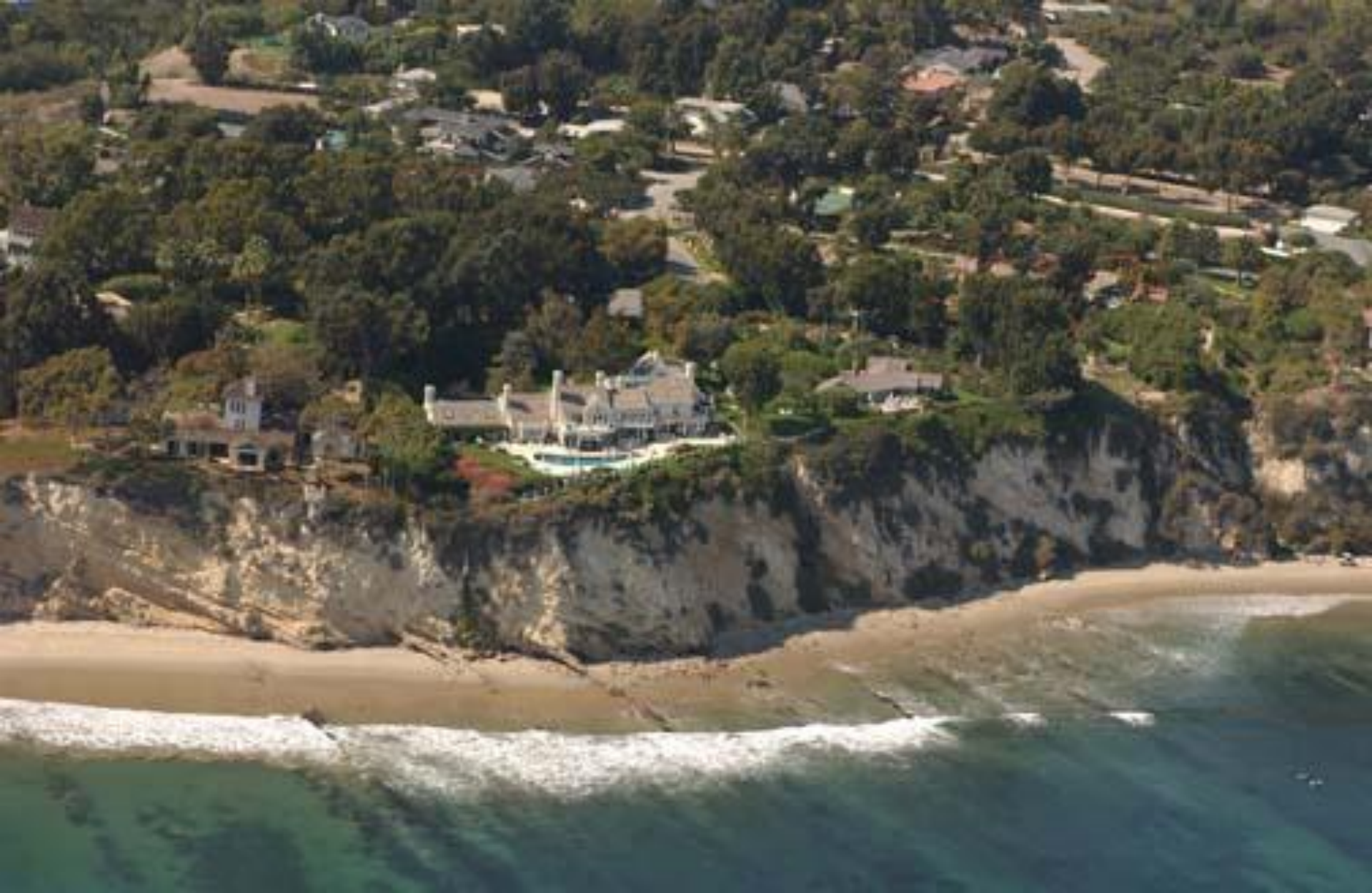
Barbara Streisand's house.